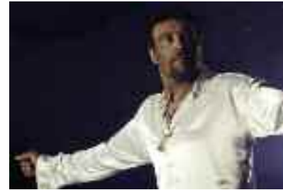
HAMILTON BROWNE AS LIONEL RICHIE

All main courses will be accompanied by roast & new potatoes and a selection of seasonal vegetables